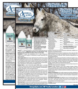
EQF025 - ADREN-FX™ DOUBLE-SIDED (8.5" x 11")