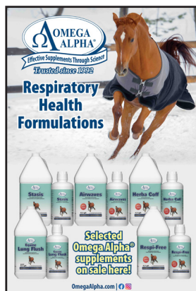
EQPT006 RESPIRATORY HEALTH POSTER - 12" x 18"