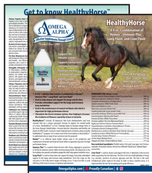
EQF002 - HEALTHYHORSE™ DOUBLE-SIDED (8.5" x 11")