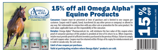
EQUINE RETAIL COUPON - AVAILABLE IN ENGLISH & FRENCH