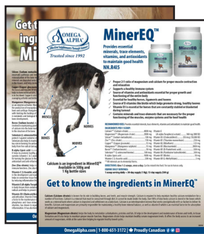
EQF018 - MINEREQ™ DOUBLE-SIDED (8.5" x 11")