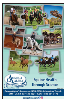
EQB001 - EQUINE CATALOGUE (5.5" x 8.5")