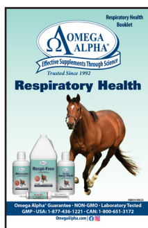
EQB010 - RESPIRATORY HEALTH BOOKLET (5.5" x 8.5")