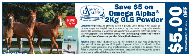
EQUINE RETAIL COUPON - AVAILABLE IN ENGLISH & FRENCH