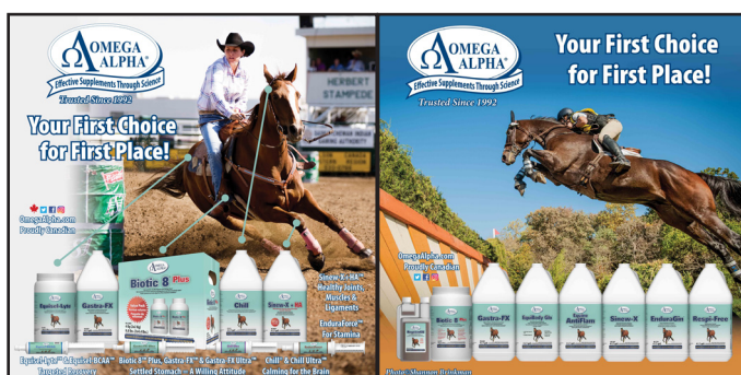
EQB017 - EQ PRODUCTS: YOUR FIRST CHOICE FOR FIRST PLACE DOUBLE-SIDED (30" x 30")