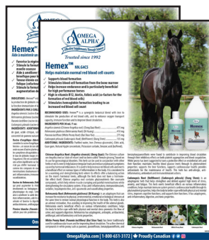
EQF019 - HEMEX™ DOUBLE-SIDED (8.5" x 11")