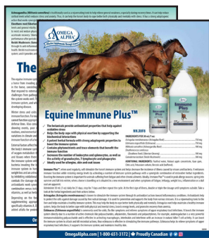
EQF004 - IMMUNE PLUS™ DOUBLE-SIDED (8.5" x 11")