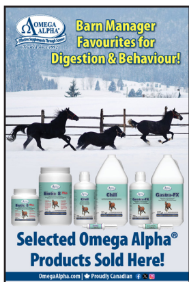
EQPT011A DIGESTION & BEHAVIOUR POSTER - 12" x 18"