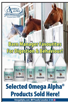
EQPT011 DIGESTION & BEHAVIOUR POSTER - 12" x 18"